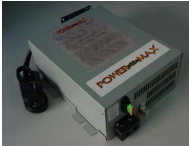
AC to DC Converter/Charger