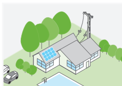
Residential grid-tie solar with backup power