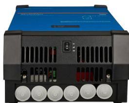
MultiPlus 2000 VA (with bottom cover)