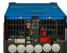
MultiPlus 2000 VA (bottom cover removed)